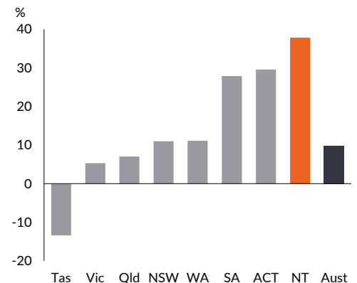
Chart 2: Number of residential building approvals (year-ended change, trend)