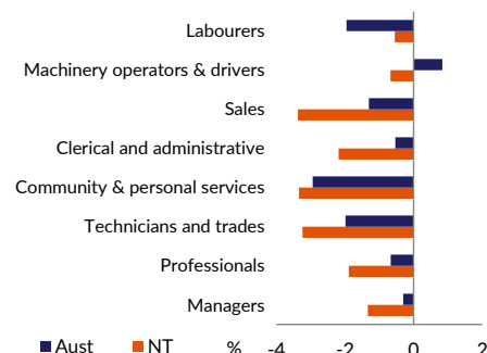
Chart 1: Internet job vacancies by industry

Source: Department of Treasury and Finance; National Skills Commission, Vacancy Report