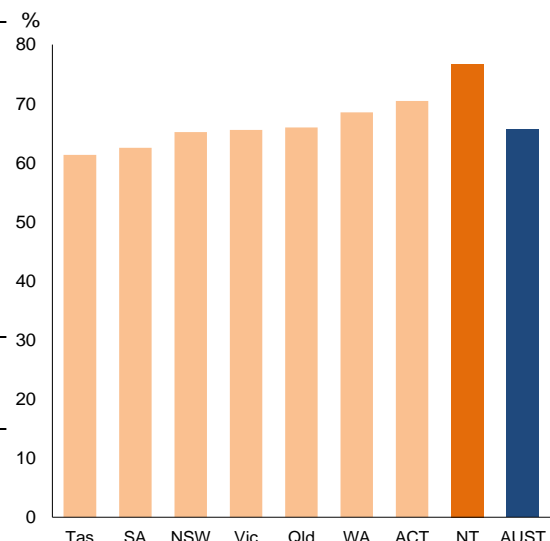
Chart 3: Trend Participation Rate