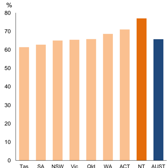
Chart 3: Trend Participation Rate