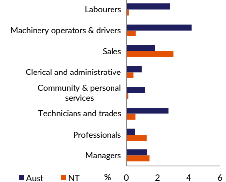
Chart 1: Internet job vacancies by industry (monthly % change, trend)