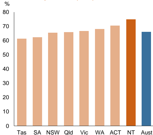
Chart 3: Participation rate (trend)