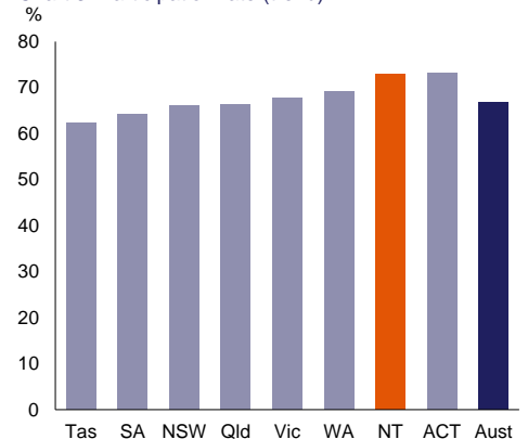
Chart 3: Participation rate (trend)