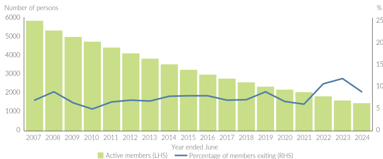
Figure 1: Membership profile

During the year, active membership of NTGPASS decreased by 8.9% from 1,619 to 1,474 due to members claiming their benefits and exiting the scheme. This is the first time since 2021 that NTGPASS has experienced a single-digit percentage decrease in the number of scheme members. As shown in Figure 1, since 2007 the average rate of members leaving is 7.6% per annum. For 2023-24, it is difficult to attribute the decrease in membership cessations to any specific external event but reasonable to conclude that exit rates may be returning to pre-covid levels despite the increasing age profile of scheme members.