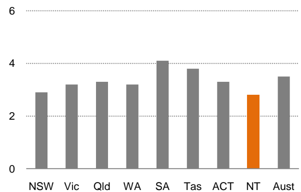
Figure 1: Average length of stay in public hospitals (days), 2010-11