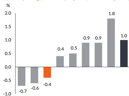
Chart 1: State final demand (quarterly change, seasonally adjusted, inflation adjusted)