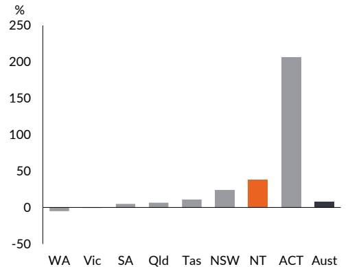
Chart 2: Number of residential building approvals (year-ended change, trend)