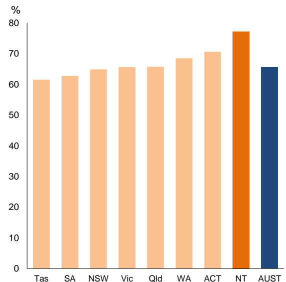
Chart 3: Trend Participation Rate