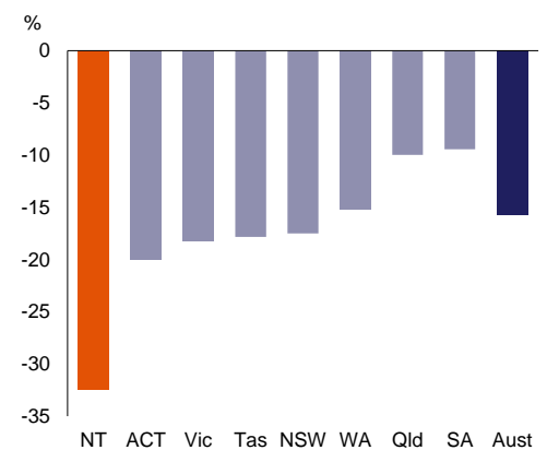
Chart 2: Number of residential building approvals (year-on-year percentage change)