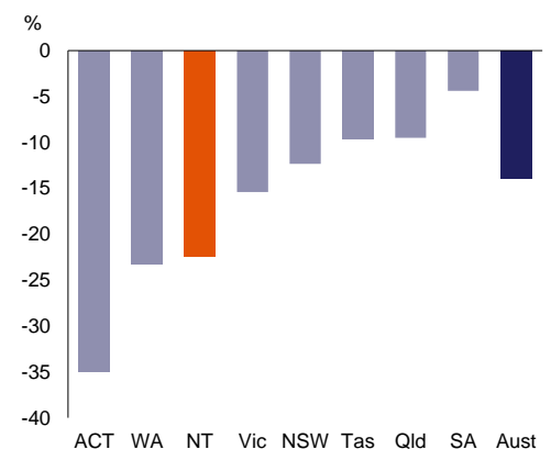
Chart 2: Number of residential building approvals (year-on-year percentage change)