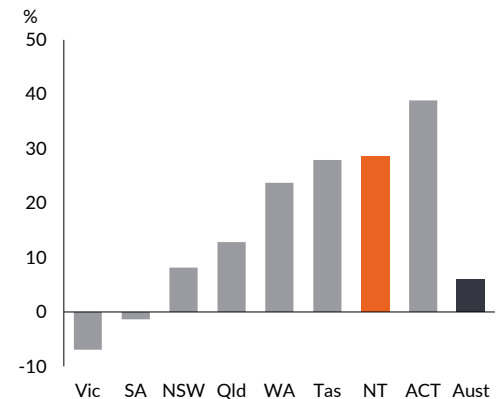
Chart 2: Number of residential building approvals (year-ended change, trend)