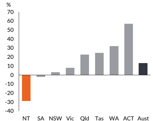
Chart 2: Number of residential building approvals (year-ended change, trend)