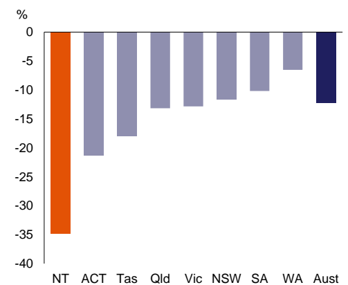
Chart 2: Number of residential building approvals (year-on-year percentage change)