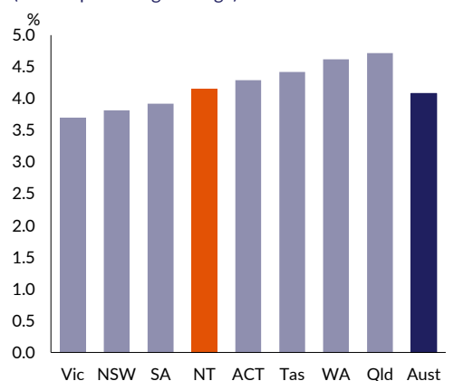
Chart 3: Wage price index by jurisdictions (Annual percentage change)