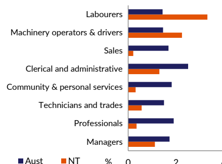
Chart 1: Internet job vacancies by industry

Source: Department of Treasury and Finance; National Skills Commission, Vacancy Report